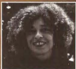
Angela Y. Davis

"In this extraordinary book, Angela Davis challenges us to confront the human rights catastrophe in our jails and prisons. As she so convincingly argues, the contemporary U.S. practice of super-incarceration is closer to new age slavery than to any recognizable system of 'criminal justice.'"